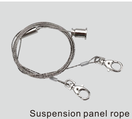
Suspension panel rope