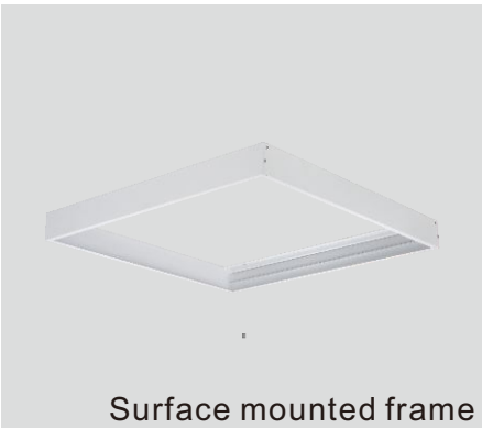
Surface mounted frame