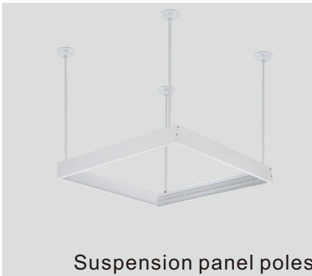
Suspension panel poles

NOTE: Suspension mounted and surface mounted accessories to be order as separated parts